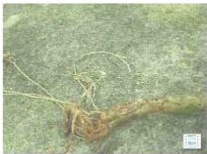
Figure (i): Roots of a cacti plant as presented by students.