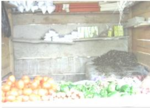
Figure (vi): Grouping of items in a local kiosk.