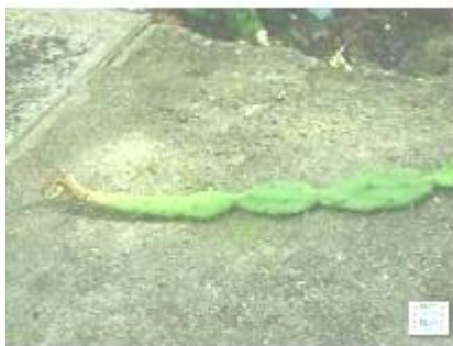
Figure (ii): Leaves and stem of a cactus plant as presented by students.

As the students sat in their groups in the biology lab, the students had a chance to discuss, touch, open the leaves and spread the root system, distinguish and make comparisons between plant leaves, stem, roots and seeds (for those with seeds at the time of collection) and finally summarize all the information on their worksheets. They managed to integrate their knowledge according to their observations. Students were also able to discuss about the cactus plant, they could see the roots which were fibrous and some very small leaves which could not be easily seen from the pictures in their textbooks. This was one of the learning experiences that most students said they cherished as they were able to classify the unknown plant (to them by then) as a monocot plant.