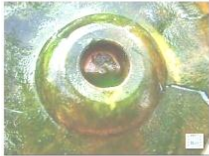
Figure (iii): Moss plants growing near a river Figure (iv): Algae growing on moist surface

After, the discussions, the moss plants were observed under a microscope, and the students were able to draw the required features of a moss plant. These results concur with the standards set by NRC (2000) that learners do go beyond merely hands-on experiences, but, they are also actively engaged in discovering a phenomena, at the same time exploring possibilities and making sense of learning scientific ideas through inquiry (Wee, Fast, Shepardson, Harbour, & Boone, 2004). Hence, the use of the local environment provided relevancy to the biology class and the teaching of biological classification, as learning was connected to the outside of class and at the same time encouraged learning scientific facts.